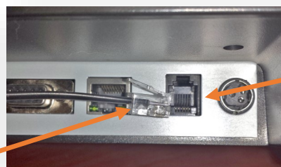
Cash Drawer's Cord