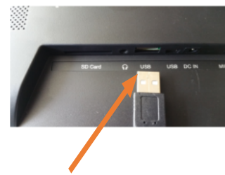
This is the Plug on the Side of the Tablet for the USB Connection to the Printer