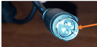
This is the Plug for the Printer's Power Cord