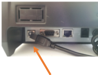
This is the Plug on the Back of the Printer for the USB Connection to the Tablet